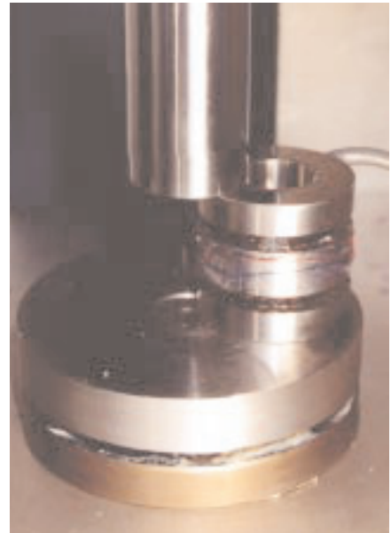
Off Axis Load test