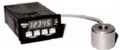
Helix™ Load Cell with SM50 Display